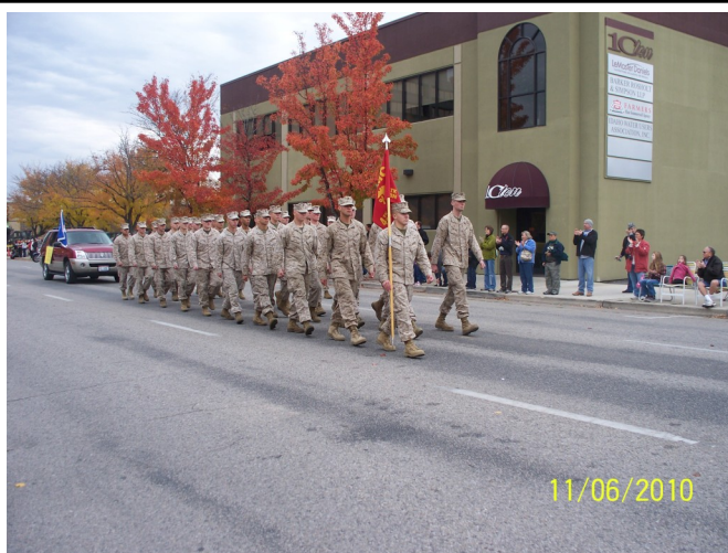
Charlie Company 4th Tank, marching by on downtown Boise, Idaho Veterans Day parade ceremony