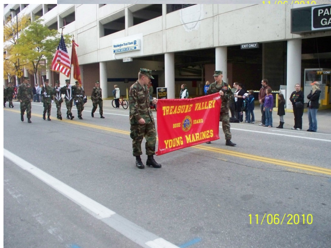
Treasure Valley Young Marines performing their skills in marching at Veterans Day Parade